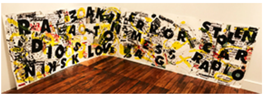
FREE RADIO SCROLL A landscape of conversations. Without noise, signal is meaningless. Stolen Car Radio is about a car trunk filled with purloined radios.

PRAISE YELLO Praise Prayers. Even more positive yelled. NO #12 "NO" means "NUMBER". Hence, math anxiety THE OTHER GUY gets to do other stuff, you do you then NO The value of plain old nothing. The ORDINARY!